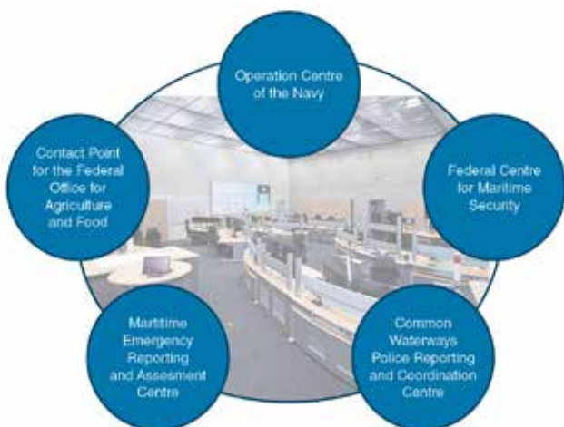
JERACS partner facilities

The security agencies represented in the MSSC are equal partners in the network. For optimal task management, the JERACS comprises the following control stations and facilities merged together.