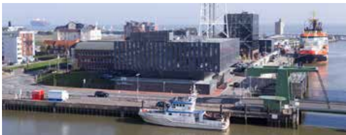
View of the MSSC in the Cuxhaven harbour area

The 16-metre-high building is subject to high security requirements and is classified as a “critical infrastructure”. This is a designation for facilities that have a significant importance for safety (here: in the maritime sector). For this reason, the building is not open to the public.