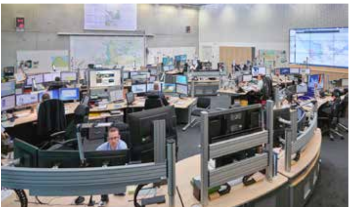
JERACS interior view

There are also two special situation rooms on the same level as the JERACS.